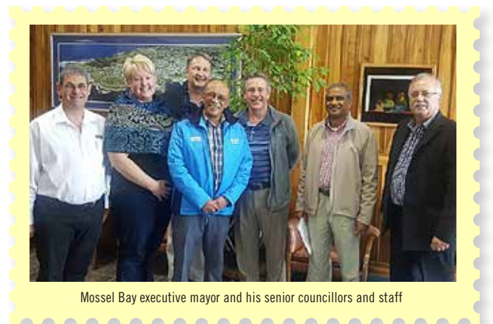
Mossel Bay executive mayor and his senior councillors and staff

On another visit to Mossel Bay, I was privileged to be able to have a meeting with the executive mayor and his senior councillors and staff.