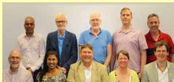
Attendees were Fiji Islands, Australia, Sweden, Finland, the Netherlands, New Zealand, Canada (and USA) and South Africa

It was certainly an honour to serve on this international body and be allowed the privilege by IMESA to attend three of the meetings. I attended the IFME Board Meeting and the Infrastructure Symposium in Suva, Fiji, in April. Only eight member countries were represented this year, largely due to the very long and difficult travel arrangements for such a short period.