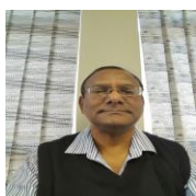
Mr J Naidoo Road Transport / Storm Water