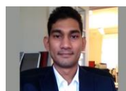
Mr S Kasserchun Building / Town Planning